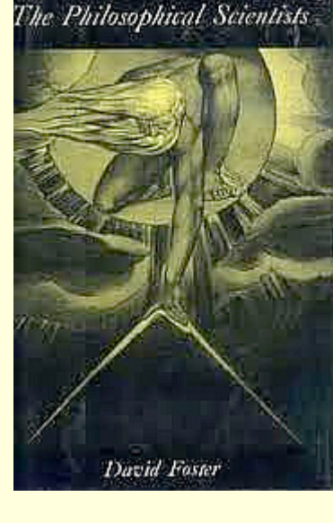
"I did not set out to destroy Darwinism" (David Foster)

updated 9 Apr 2018 (first published: 12 Sep 1997)